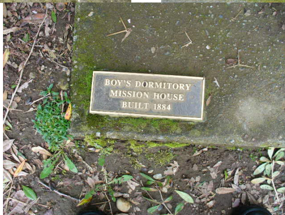
The school "buildings" now