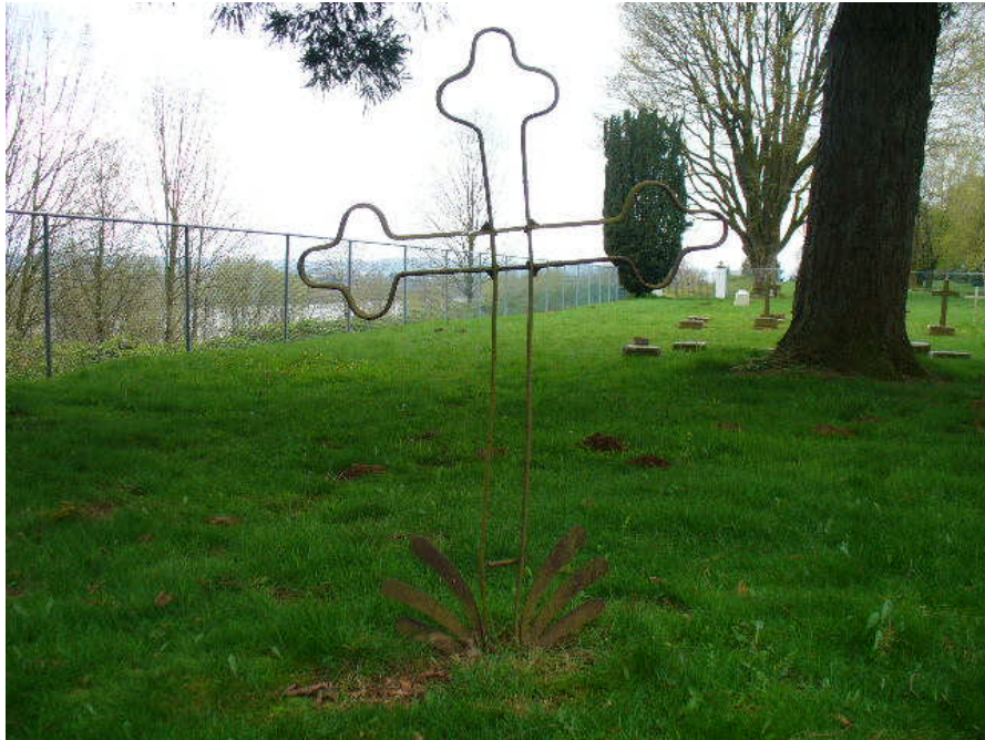
One of the iron crosses still in the cemetery