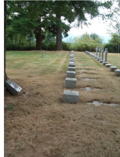
General views of the cemetery

Row 1 is right by the gate and runs from south to north, with row 15 at the eastern end. These rows were walked from south to north. Then there are two rows, 16 and 17, at the northern end that run east west and these were walked from east to west. These are all for members of the OMI community. This is not a big cemetery and easy to get around in. But the row and marker numbers are just a guide, new markers and/or removed markers will change the numbering. Some of the rows appear to be very short and probably have many known burials with no markers.