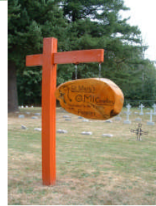
Central cemetery sign

OMI stands for Oblates of Mary Immaculate, a teaching-missionary order of roman catholic priests. The cemetery is located in the Heritage Park and is owned by OMI order but is maintained by the staff of Heritage Park. This is a pioneer cemetery and is still an active cemetery with some members of the OMI order still being buried there.