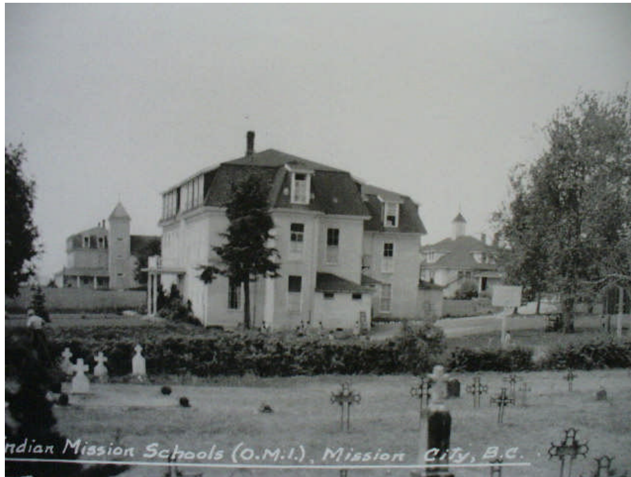
The dormitories from the cemetery

The mission was primarily a residential school for First Nations children. Near to the cemetery are the old foundations from the dormitories, the barn and other buildings. These have been left but be careful when walking in them. The bell is from the church. Up on the hill is the grotto of Our Lady of Lourdes which was established in 1892. Many pilgrimages have been made to this grotto. The present building was opened in 1997, built on the foundations of the original. The grotto is open on very restricted hours. For these hours contact Heritage Park.