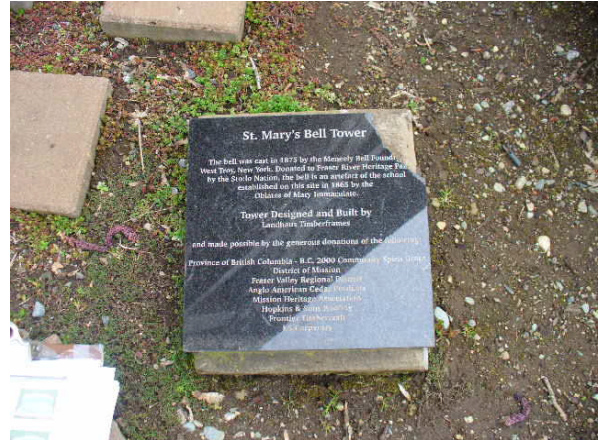
The bell tower and dedication marker