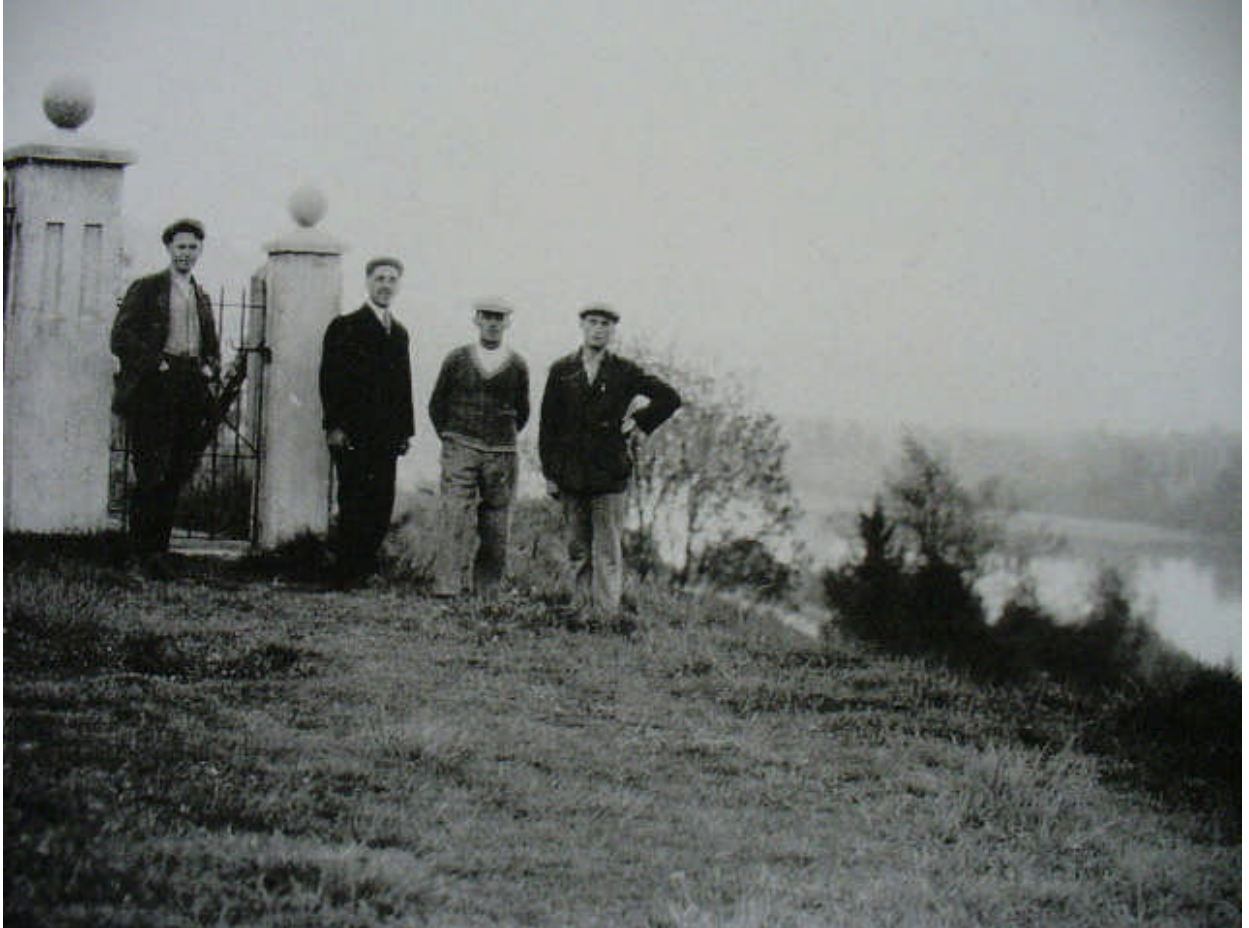
The cemetery workers at the gates c1930