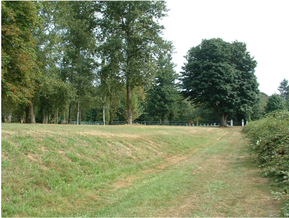
The road up to the cemetery