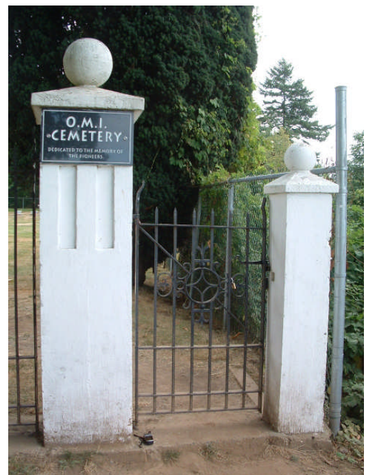
The cemetery gates now